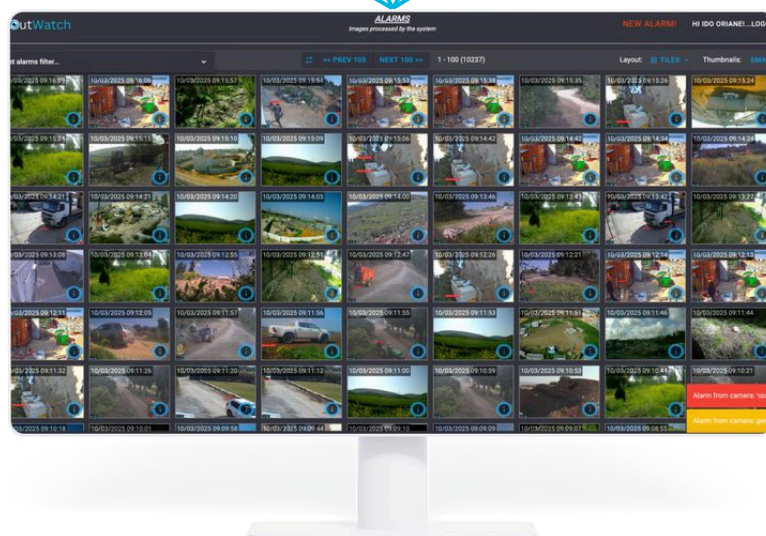
OutWatch can control different manufactures in one software